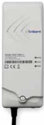
Trilliant Communications Hub